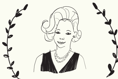
JACK'S WIFE FREDA

ALL DAY CAFE - BREAKFAST - LUNCH - BRUNCH - DINNER